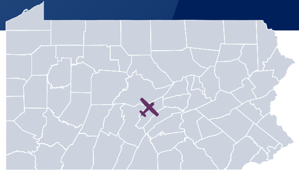
This airport is classified as a Advanced Airport in Pennsylvania's State Aviation System Plan and is eligible to receive federal funding from the FAA.

Mifflin County Airport (RVL) is a general aviation airport located two miles south of Reedsville, directly in the center of Pennsylvania. The airport is proud to encourage general aviation and air commerce while enhancing local economic development. The airport is home to private flight instructors and provides for transportation for local businesses, and recreational flights. The airport is also well-known for glider aero-towing and the Mifflin County Soaring Club hosts an annual glider contest. The airport is also home to an EAA chapter, which has regular events, such as a ground school and a monthly breakfast that is attended by the community and pilots. The airport hosts community events during the summer months. Local and regional businesses utilize the airport for access to central Pennsylvania as well as storage of aircraft in enclosed hangars. Currently, all airport hangars are leased and the airport maintains a waiting list. These amenities, combined with the aviation and non-aviation related activities seen on-site, make the airport a key part of the local community.