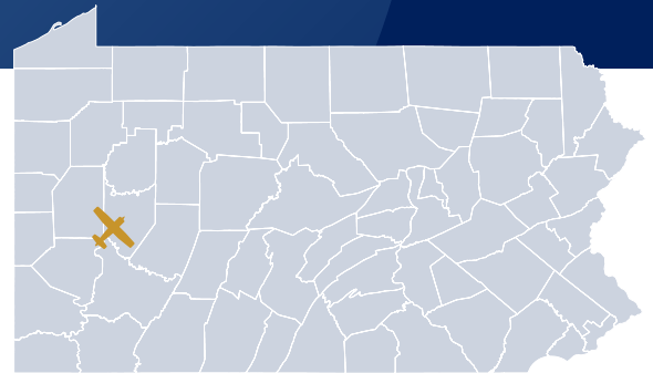
This airport is classified as a Limited Airport in Pennsylvania's State Aviation System Plan.

Mcville Airport (6P7) is a general aviation airport located seven miles northeast of Freeport. As the only airport in the entirety of Armstrong County, the airport provides critical access for air ambulance services along with aerial firefighting, flight training, aerial photography, and many other types of general aviation operations. For those pilots and passengers flying into the airport for leisure, its prime location offers quick access to golf resorts, hunting and fishing preserves, and many other outdoor activities offered in western Pennsylvania. The airport not only supports Armstrong County and the region through its operations, but also through the flight training school located on site which provides jobs for the community and trains the next generation of pilots. The airport's variety of services and its advantageous location mean that it is able to support the diverse aviation needs of the region.