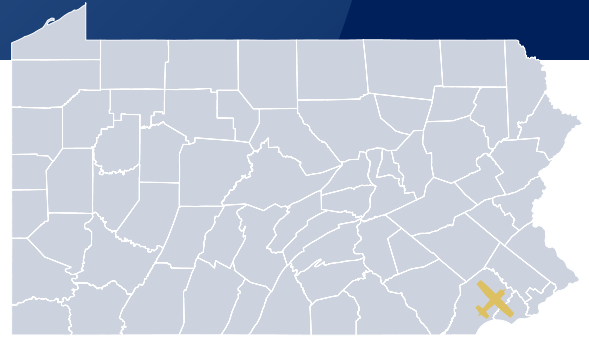
This airport is classified as a Basic Airport in Pennsylvania's State Aviation System Plan and is eligible to receive federal funding from the FAA.

Brandywine Airport (OQN) is a general aviation airport located in West Chester within the Route 202 Corridor region. The airport supports a wide variety of aviation activity, including flight training, corporate and business activity, and air charter. Many businesses call the airport home and provide valuable services to the local community, including the American Helicopter Museum, Brandywine Flight School, and Brandywine Aviation and Maintenance. These businesses not only provide services for the region, but also create jobs for the local community. Individuals also use the airport to facilitate business meetings in a larger radius from their local offices, which helps retain and attract businesses to the community. Additionally, the airport provides a staging area for local fire and police departments conducting medical and police activities. The airport is an important asset to the region and will continue to play an important role within the community well into the future.